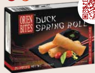
DUCK SPRING ROLL 60g Code: FF-OBCN-154 1.2kg (60g x 20 pieces) x 6 packs per carton

An iconic food in much of East Asia, the crunchy spring rolls are everywhere, from street food stalls to fancy dining parties. Made from a wide range of ingredients and vegetables, our spring rolls will be delightful additions to your menu!