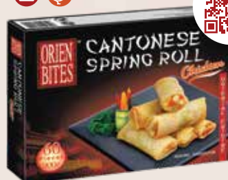
CANTONESE SPRING ROLL-CHICKEN Code: FF-OBCN-123 900g (15g x 60 pieces) x 12 packs per carton