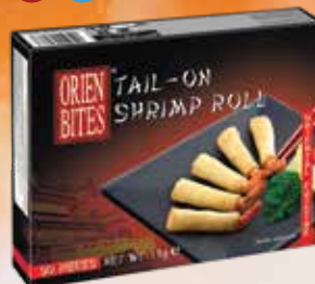
TAIL-ON SHRIMP ROLL 20g Code: FF-OBCN-144 1kg (20g x 50 pieces) x 6 packs per carton