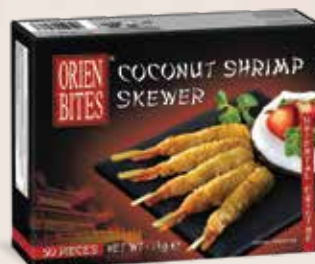
COCONUT SHRIMP SKEWER Code: FF-OBCN-094 1kg (20g x 50 pieces) x 6 packs per carton