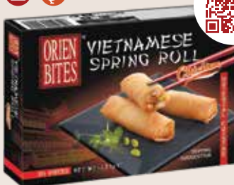
VIETNAMESE SPRING ROLL-CHICKEN Code: FF-OBCN-137 1.2kg (60g x 20 pieces) x 6 packs per carton