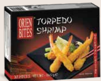
TORPEDO SHRIMP Code: FF-OBCN-119 800g (25g x 32 pieces) x 6 packs per carton