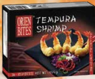
TEMPURA SHRIMP Code: FF-OBCN-128 800g (22g x 36-37 piece) x 6 packs per carton