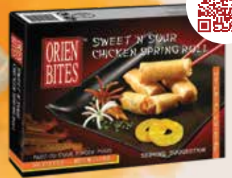
SWEET 'N' SOUR SPRING ROLL Code: FF-OBCN-102 1kg (20g x 50 pieces) x 6 packs per carton