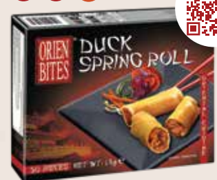
DUCK SPRING ROLL 20g Code: FF-OBCN-105 1kg (20g x 50 pieces) x 6 packs per carton