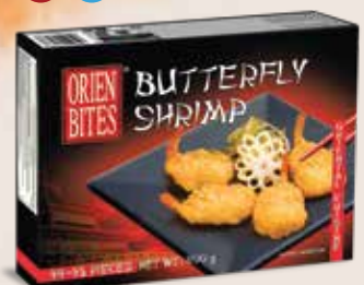
BUTTERFLY SHRIMP Code: FF-OBCN-117 800g (18g x 44-45 pieces) x 6 packs per carton