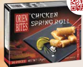
CHICKEN SPRING ROLL Code: FF-OBCN-039 1kg (20g x 50 pieces) x 12 packs per carton